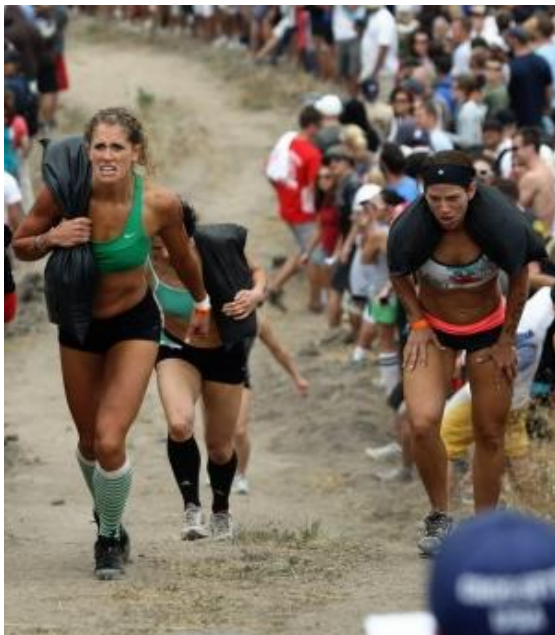
CrossFit Games 2010

CrossFit allows women to see that health is so much more than weight loss, a dress size or a read-out on scales. It allows the female athlete to see that within physical and mental empowerment lies true confidence and inner beauty, with an increased self-esteem, all forged through extending those margins, or comfort zones through the challenge found in CrossFit.